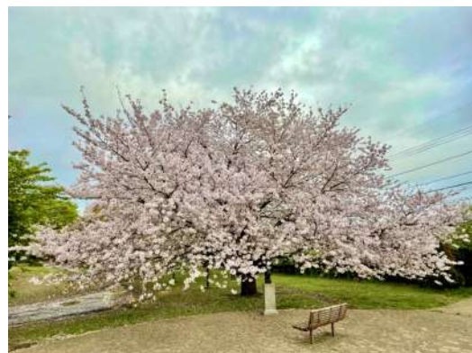
Beautiful Sakura Blossom in Tokyo