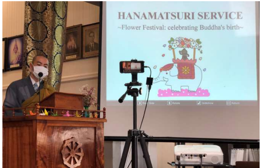
Live Streaming on Facebook & viewed on YouTube