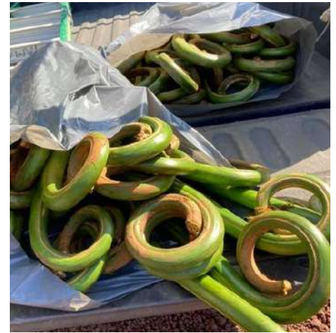
Fresh Kakuma Curls