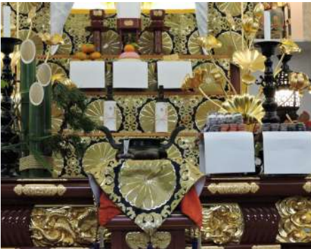
Mochi, Omamori & Kadomatsu New Year Blessing Service

If you have any questions, please call 808-935-8407 for more details.